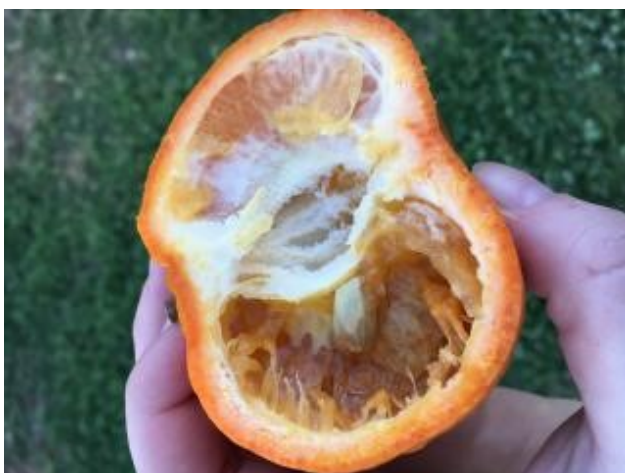
Damaged orange flesh caused by Medfly larvae

Medfly larvae also damage the inside of the fruit as they eat it, resulting in bruised and broken fruit flesh. Medfly larvae can be found in fruit that is both on the tree or fallen on the ground.